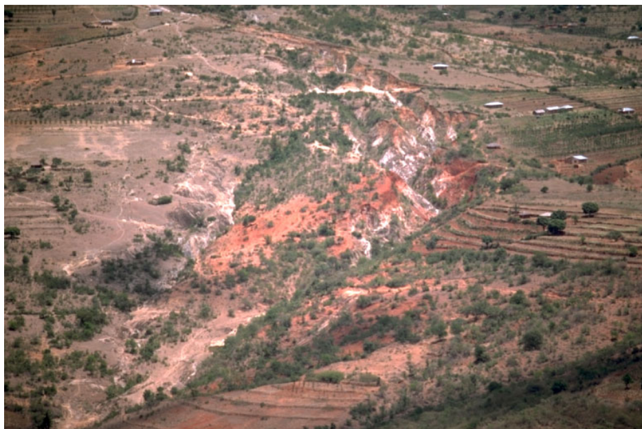
Fig. 1: Land degradation and conservation in Machakos district, Kenya.

WOCAT has launched this new initiative for a global SWC map in order to show in which areas water, soil and vegetation are used sustainably. Existing maps show degradation at various scales for various land use and degradation types, but there are hardly any maps focusing on the positive aspect of the countless conservation efforts undertaken all over the world. Along with the demand for such maps at a regional, national, or sub-national level, there is also a need for a global-scale overview of achievements in preventing and combating land degradation.